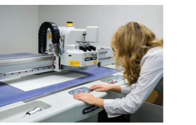
Capabilities: Hot melt glue, handles, embellishments, graphic design, lamination, different print types, specialised RecycleMe™ coating.