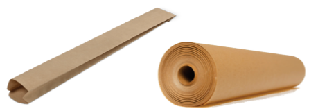
Can End Bags & Snake Wrap