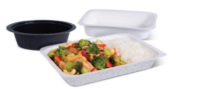
Ovenable board and paper for airlines, convenience stores etc