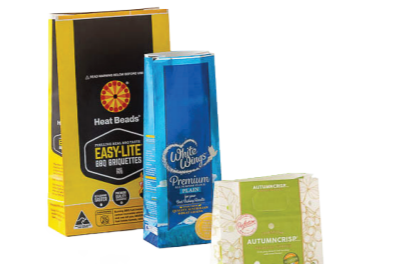
SOS (Self Opening Satchel)