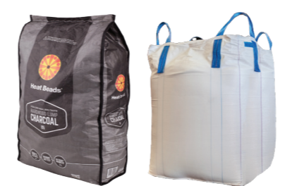
WPP & FIBC