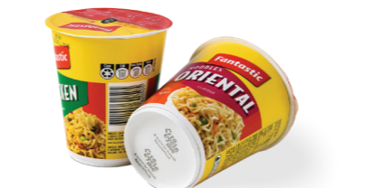
Cups & Bowls